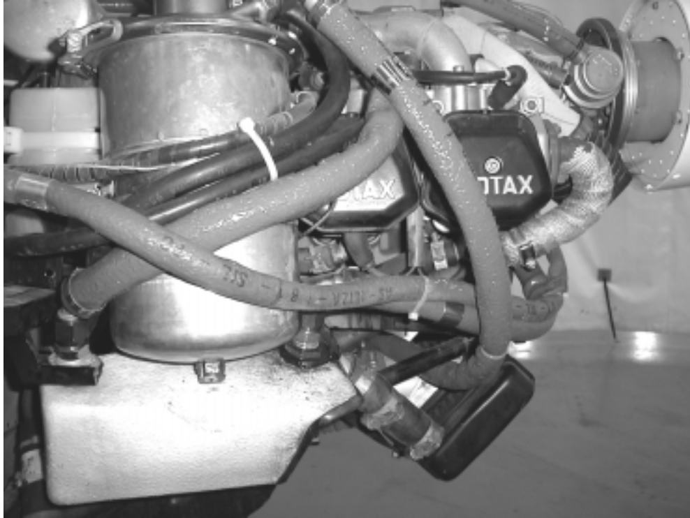
Figure 2: Routing and securing oil lines (RH, looking inboard).