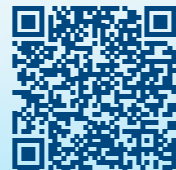
scan to learn more about our DA42-VI