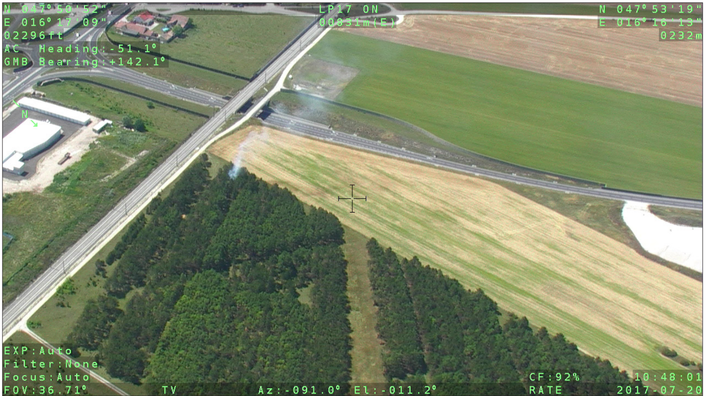
Fire spotted by Diamond DA42 MPP